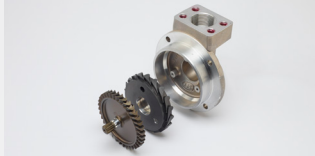
Rear Serviceable Motor

Introducing the Ingersoll Rand ST150 Series mid-range turbine engine starter. Packing a powerful 47 HP in a solid aluminum turbine motor, this new family of air starters is based on the patented next generation technology from the rugged, long lasting, easy to service, high performing and efficient ST1000 turbine starter. Built to withstand the toughest environmental and working conditions – combining robust features and flexibility to deliver reliable, heavy-duty starting in a wide variety of industrial, oil and gas, marine, power generation, rail, and mining applications.