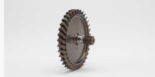
Solid Aluminum Turbine